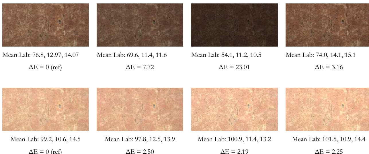
Figure 1, Above images without cat, below images with cat correction

In the same way comparison can be achieved between a replacement stone and a building that needs to be restored. In the following example (fig. 4), the image of sandblasted Barutel stone surface has been scaled by taking the R_r (equ. 7) and white reference of the frontage image (equ. 3). This virtual replacement allows estimating the compatibility of a textured surface in its future environment.